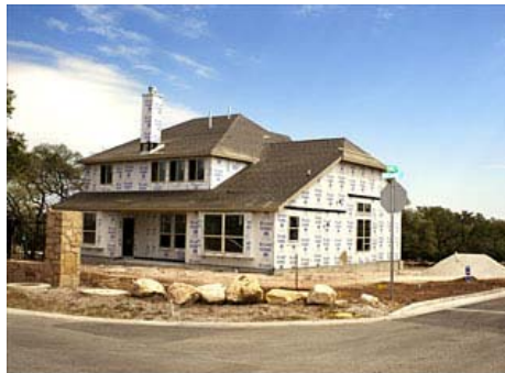
A home under construction in Austin. The number of new homes in the pipeline nationwide is quite low.