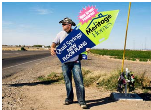
Drumming up sales

Two basic factors are laying the foundation for dramatic recovery in residential real estate. The first is the historic drop in new construction that so amazes Castleman. The second is a steep decline in prices, on the order of 30% nationwide since 2006, and as much as 55% in the hardest-hit markets. The story of this downturn has been an astonishing flight from the traditional American approach of buying new houses to an embrace of renting. But the new affordability will gradually lure Americans back to buying homes. And the return of the homeowner will start raising prices in many markets this year.