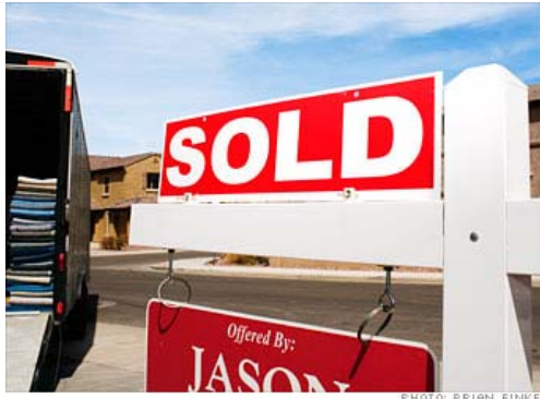
A home off the market in Mesa, Ariz.